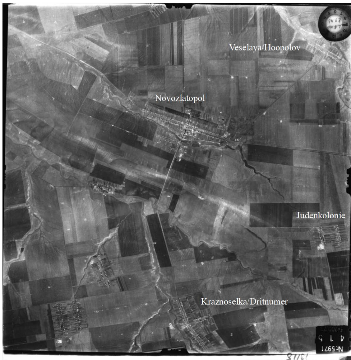
NARA photo RG 373 GX 13115 (SK)-#2 Exp 415, Sept 8, 1943